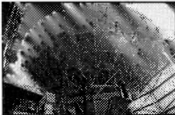
The 15m James Clerk Maxwell Telescope on Mauna Kea, Hawaii